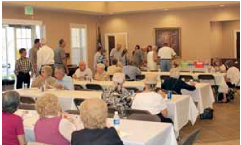
10th Anniversary Customer Appreciation cookouts held at various CBTFL office locations.